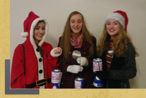
Girls from Dominican College, Fortwilliam