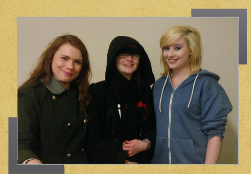
Girls from St. Genevieve's HS, Belfast